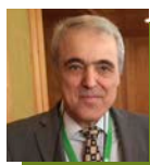
Vassilios Tsolakidis President of the BoD CRES – Center for Renewable Energy Sources and Saving